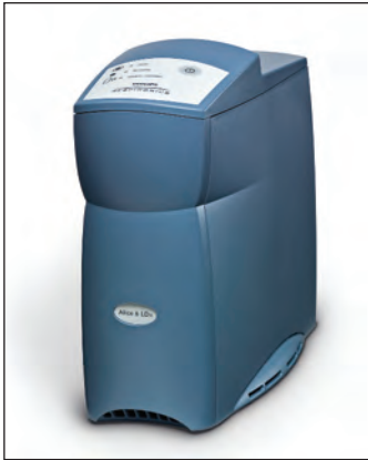
Alice 6 LDx base system, North America 1063314

Pair the LDx base station with either the LDxS or LDxN headbox for a full-featured, easy-to-understand system that allows staff to focus more on patients and less on equipment. The LDxS is the perfect front-line headbox for most sleep center needs. Use the LDxN when you need to increase from 19 EEG inputs on the LDxS to a full 32 EEG inputs. The LDx base station works with either headbox, so it's easy to have the right capability where, and when, you need it.