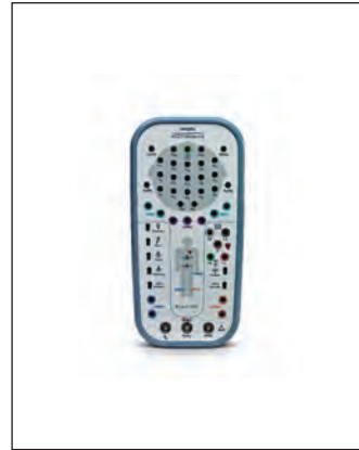
LDxS Headbox 1063552 North America 1063353 International