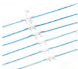
P1267, P1303 P1263, P1302