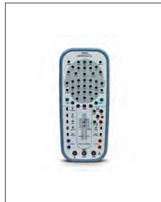
LDxN Headbox 1063476 North America 1063547 International