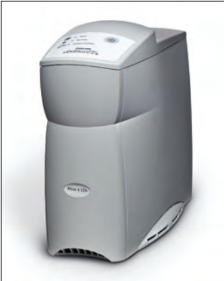
Alice 6 LDE base system, North America 1063311

The Alice 6 LDE diagnostic system provides your busy lab with the base set of channels needed to meet AASM standards while allowing staff to focus more on patients and less on equipment.