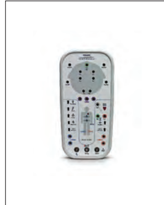
Headbox, North America 1063549